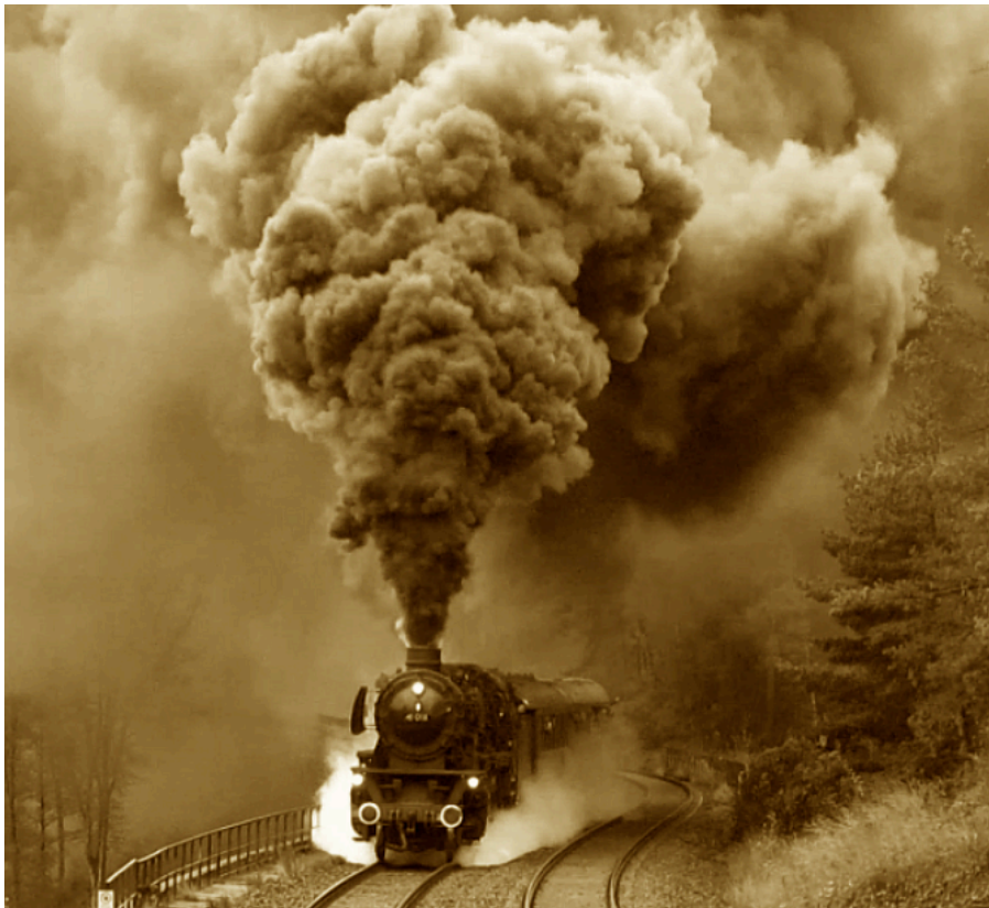
(Northwestern Pacific Headlight, 1928)