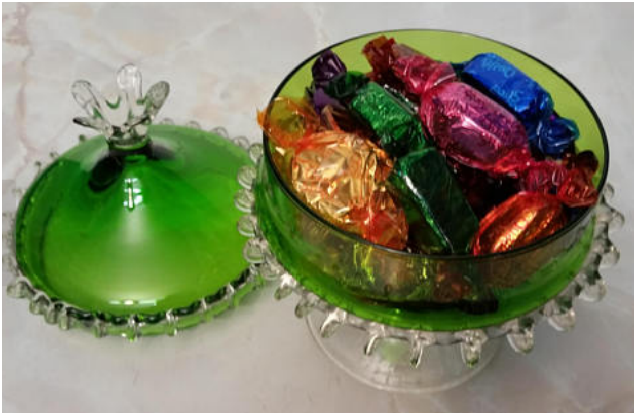
The Silver Sixpence, Fall/Winter 2008

Near midnight, an Olompali State Park manager saw a girl wearing multiple petticoats, her long, dark hair curled into side buns. He next encountered her outside his office, reaching longingly toward a candy bowl she couldn't touch. The last time they met, she gazed down at him curiously from the stair top.